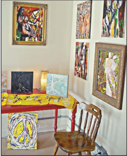
ART GALLERY upstairs at Nana's.