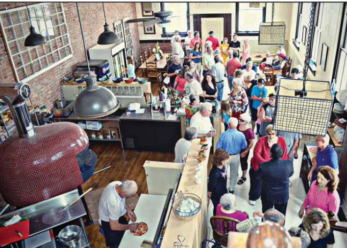
NANA'S PIZZERIA - grand opening May 10.