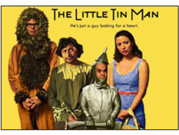
"The Little Tin Man will premiere exclusively on Time Warner Cable's Vutopia™ starting September 1st."