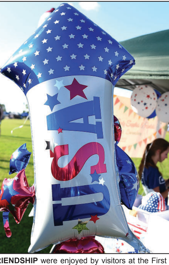
FOOD, FUN, FIREWORKS, MUSIC AND FRIENDSHIP were enjoyed by visitors at the First LawCo Freedom Fest held Saturday at LCHS football field. The energetic audience joined in sing-a-long songs by Legendary local group The Skyliters. Nashville's "Northern Lights" Band entertained prior to the nightcap fireworks display.